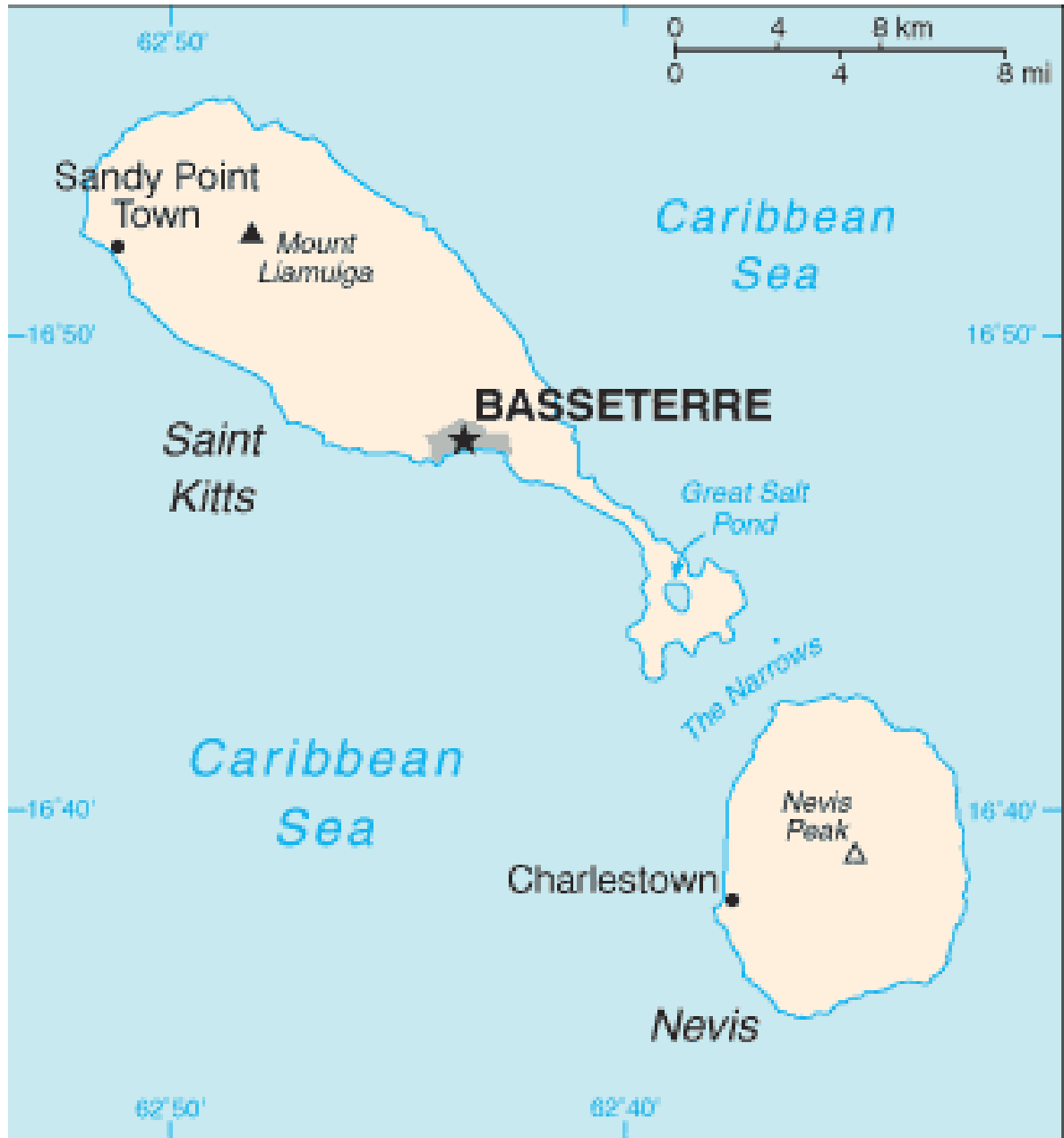
Figure 1: Location Map of St. Kitts and Nevis